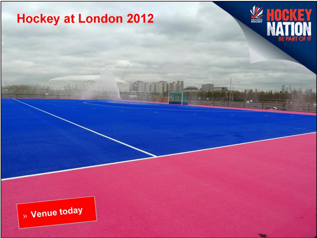
This is the hockey venue as of July 2011