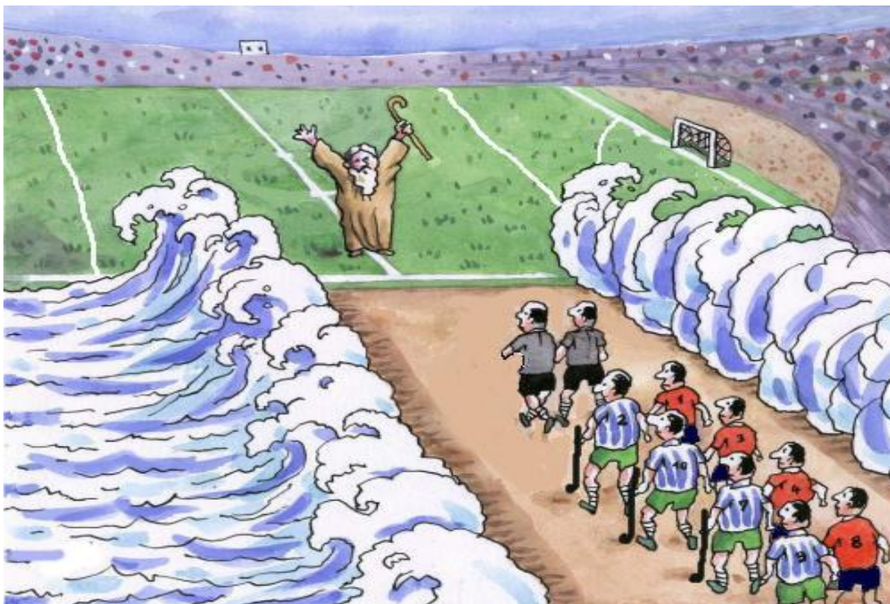
'Too right - you always get a great welcome at Grange Road.'